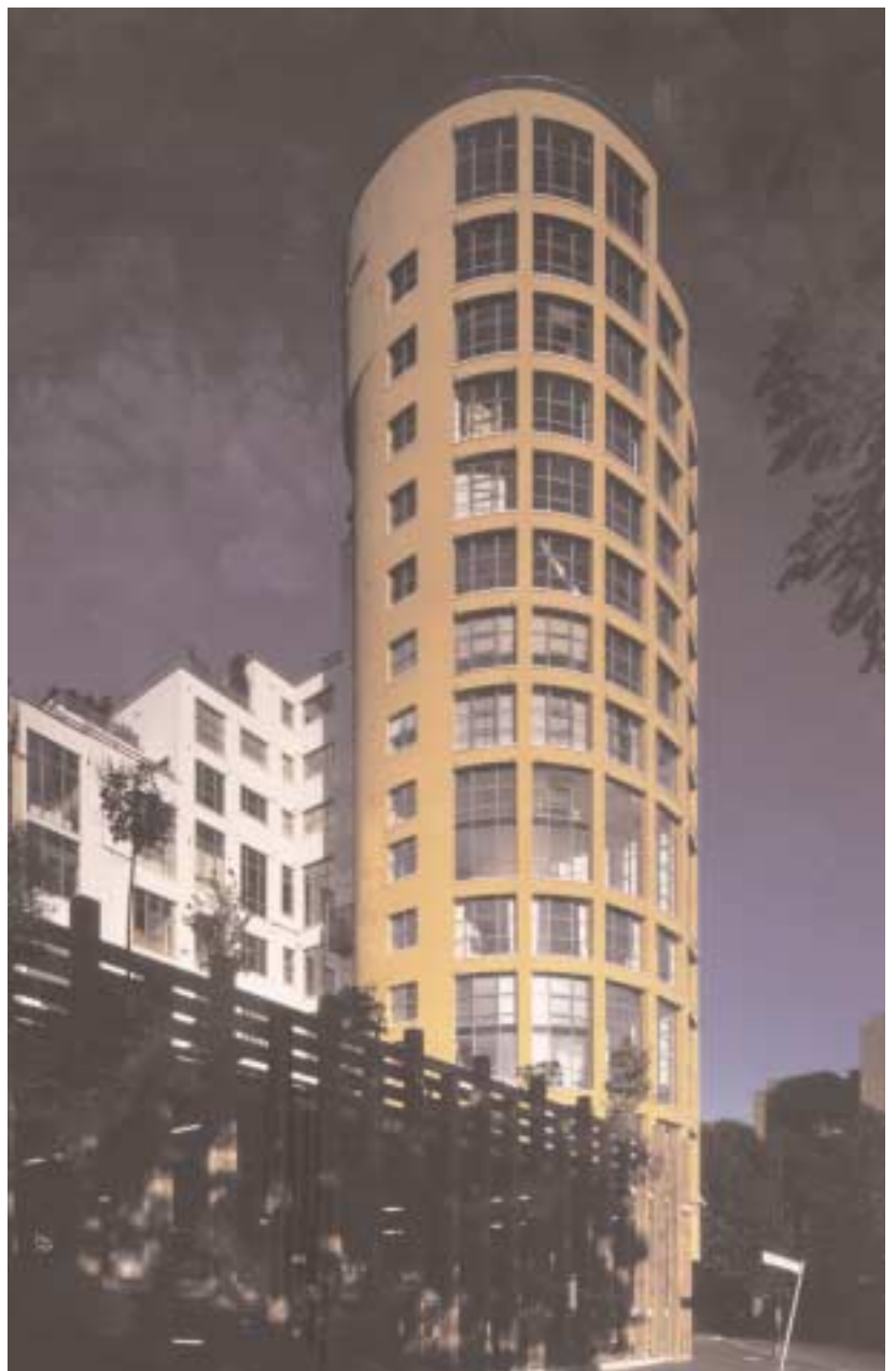
Bankside Lofts, London SE1 Architects: CZWG